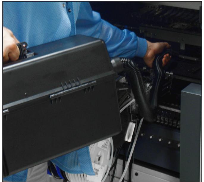
Figure 3. Using the 497 Electronic Service Vacuum

Use the power switch to power the vacuum ON. Use the carrying handle or SV-CS1 carrying strap to carry and transport the vacuum.