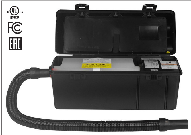
Figure 1. SCS 497 Electronic Service Vacuum