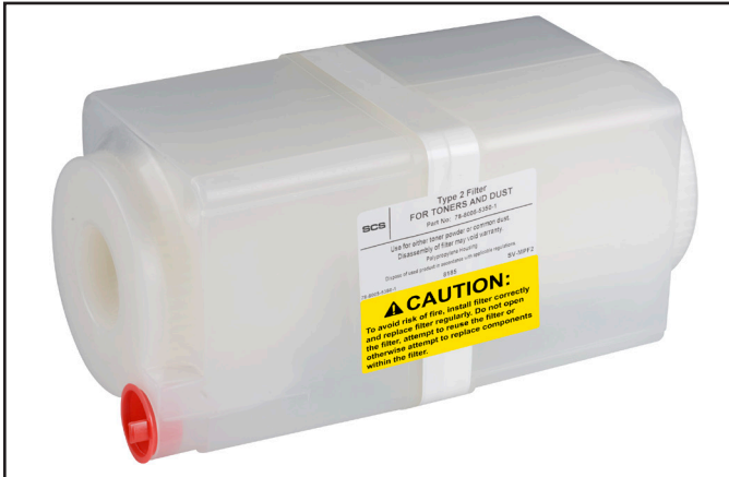
Figure 4. SCS SV-MPF2 Type 2 Replacement Filter